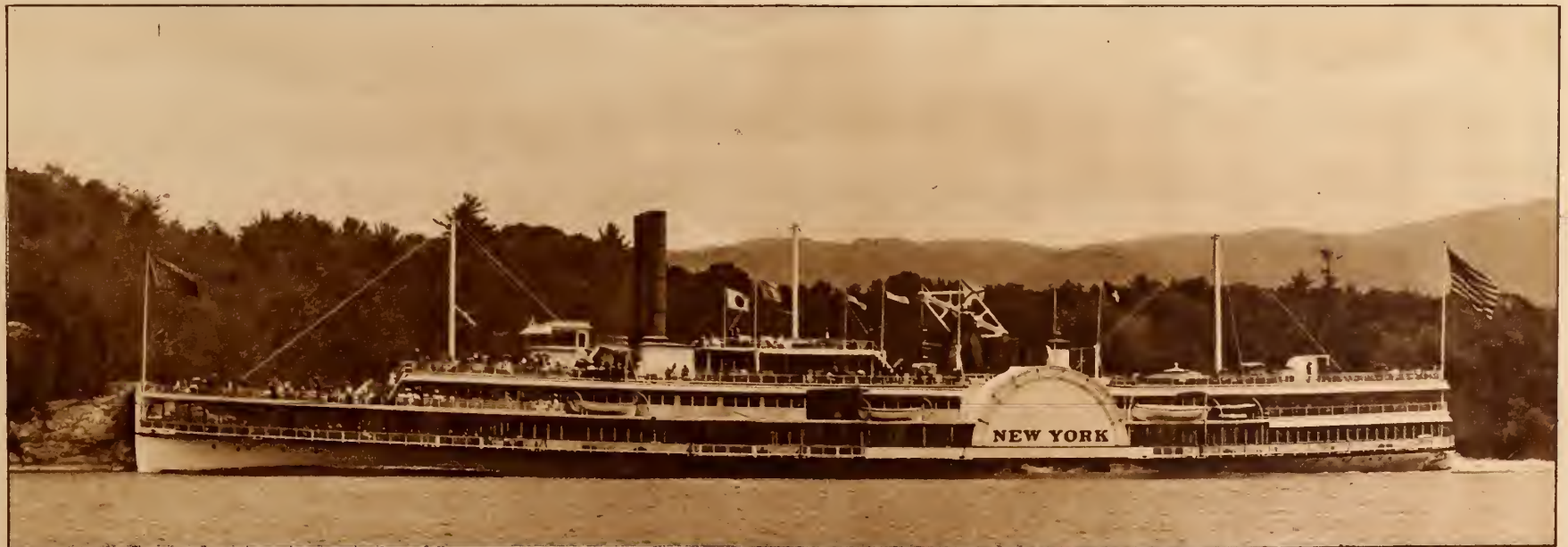
STEAMER NEW YORK OPPOSITE WEST POINT. Visitors to New York should not fail to take a trip on one of these large river steamers, showing the Hudson at its best.